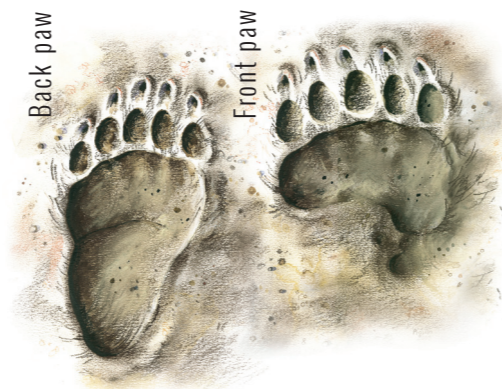
Drawing: Igor Pičulin

In general, the most important rule is to stay calm and assess the situation when encountering a bear. The next steps depend on the given situation.